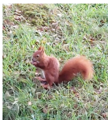
habit our isles.